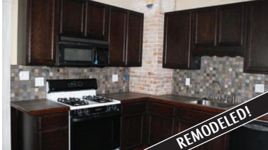
702 PROSPECT STREET, EAST JORDAN

Petoskey schools! Quiet country setting but close to the conveniences of town! Needs some TLC and finishing touches. MLS 437454. Ask for Mike Stark $39,900