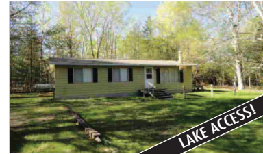
03653 COMMODORE DRIVE, EAST JORDAN