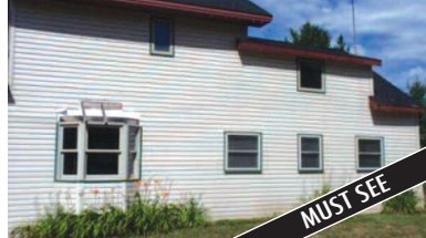
5018 RIVER RD, PETOSKEY

What a great opportunity, 11.60 Acres on US 31 with 2 Buildings 1) 48x50 3 Bays, 12x13, 10x 12, 9x11 has an office and 1/2 bath 2) 24x36 Bay 14x9. 1999 16x80 mobile home over looking large pond, a Greenhouse plus 2 wells and 2 septic The Business is not part of this listing, but the current owner is open to negotiation. MLS 435822. Ask for Holly Nierman.