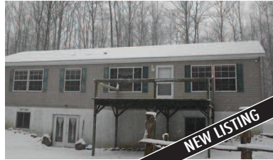
3701 AUNT FERN'S, EAST JORDAN