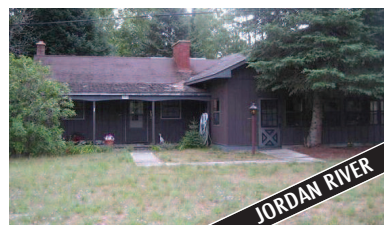
2452 MARTINSON DRIVE., EAST JORDAN