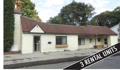
233 CEDAR STREET, BOYNE CITY

Beautifully updated 4BR, 2BA two story brick home on a quiet street near downtown. 3-Season covered porch. MLS 438318. Ask for Mike Stark. $94,900