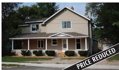
308 MAPLE • EAST JORDAN