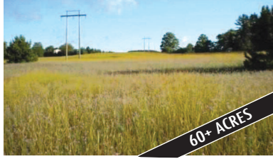
TBD MILES ROAD, EAST JORDAN

Fantastic home and location with access to the river and snowmobile trails. Beautiful frontage on the famed Jordan River. Pole barn for extra storage. MLS 435491. Ask for Mike Stark. $159,900.