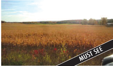
10336 ELLSWORTH RD., EAST JORDAN