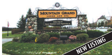
02780 BOYNE MOUNTAIN RD., BOYNE FALLS