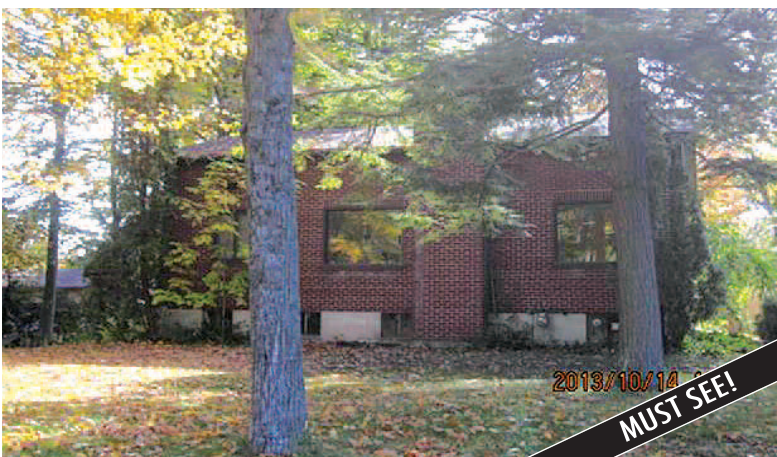
8918 CENTRAL AVENUE, CHARLEVOIX • $89,000

3 Bedroom 1.5 Bath home. MLS 438716. Ask for Mike Tomczak.