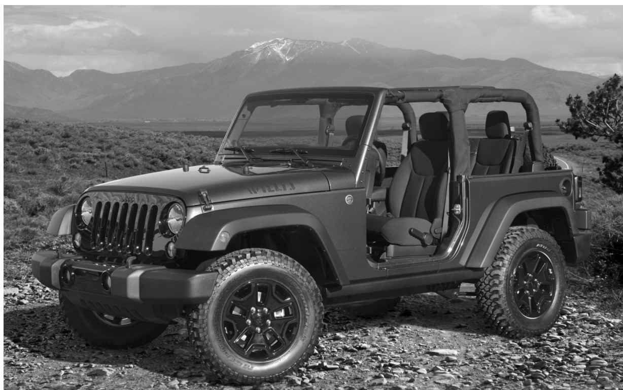
Beginning early next year, when the new 2014 Jeep Wrangler Willys Wheeler Edition arrives in Jeep showrooms, customers can connect with the original Jeep vehicle's rugged and purely functional capability.